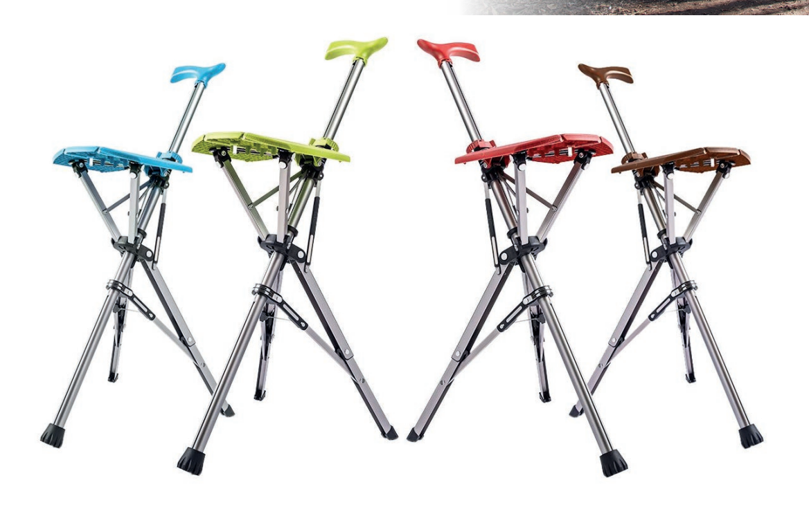
The Ta Da® chair from Iconicare is a brilliant lightweight walking stick that converts into a tripod seat at the touch of a button.

Walking Stick Converts to Chair Automatically